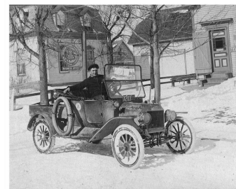
This is a photo of the Laura Wilson house on Main Street in 1916 when it was the central office of the New England Telephone & Telegraph Co. Notice the telephone emblem on the car and the telephone sign next to the front door of the house.

Telephone Office (GPS 44.531332, 67.606165)