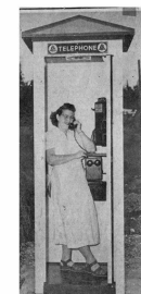
The first telephone booth in Jonesport was installed in 1953 on Main Street in the middle of town.

Jonesport Opera House (GPS 44.531186, 67.605194)