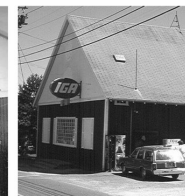
In 1968 the Opera House building was renovated and re-opened as the IGA Grocery Store. The building is currently unoccupied.