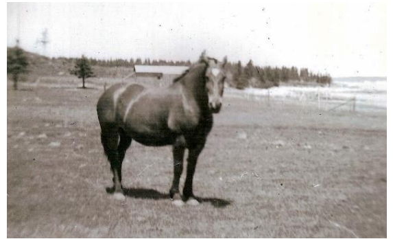
Queenie – 1938