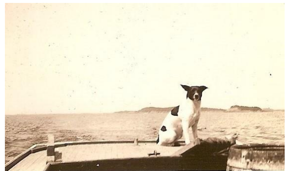
Torpedo on Olivia K , 1946