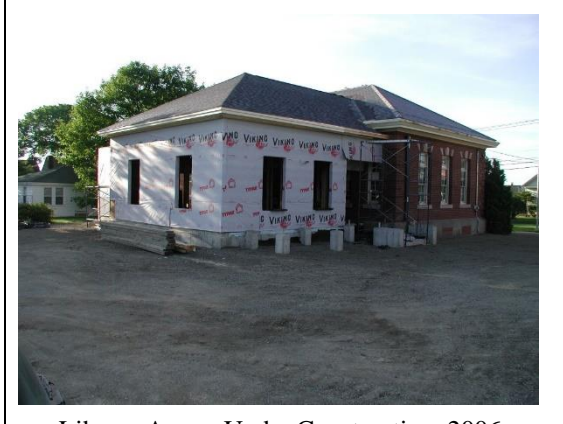
Library Annex Under Construction, 2006